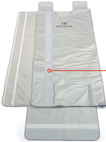
HOT HAVEN WRAP UNFOLDED

Velcro Attachment Points - These are strategically placed on the wrap. These attachment points enable the wrap to be easily adjusted to fit users of different sizes.